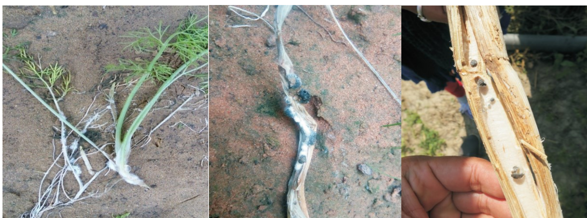
Plate: 1 Symptoms of Sclerotinia rot of fennel

Among these, castor cake was found most effective for reducing disease incidence, followed by neem. These results are in agreement with the results of Yadav et al. (2016). They reported the effectiveness of oil cakes in disease control against S. sclerotiorum